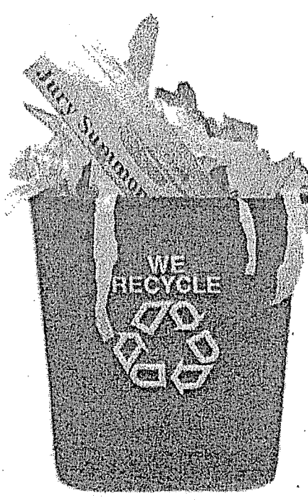
The Daily Journal Illustration

Kankakee County is cracking down on citizens who don't appear for jury duty.