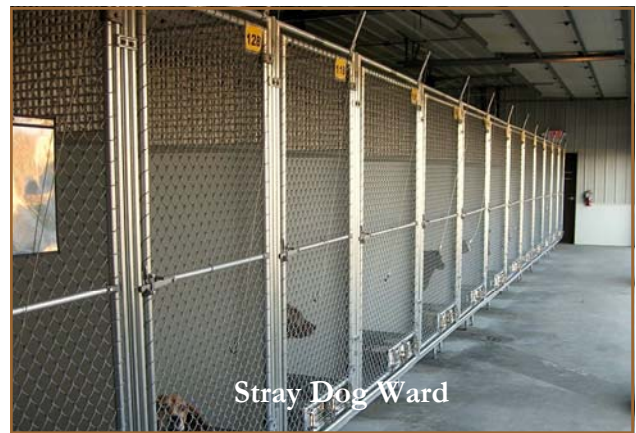
Stray Dog Ward