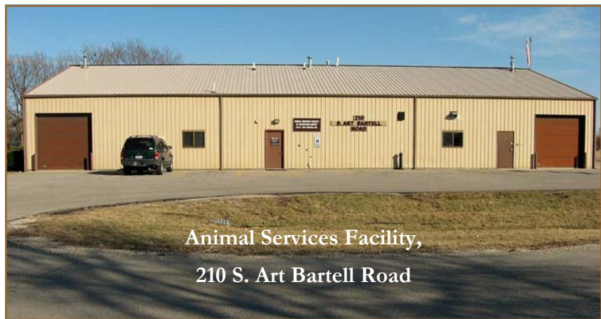
Animal Services Facility, 210 S. Art Bartell Road