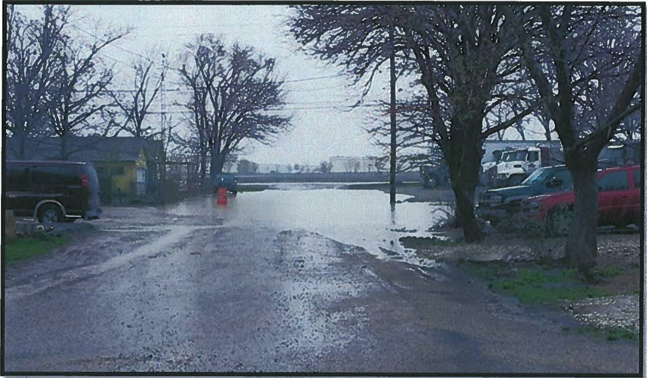
North Third Street north of Paul Avenue