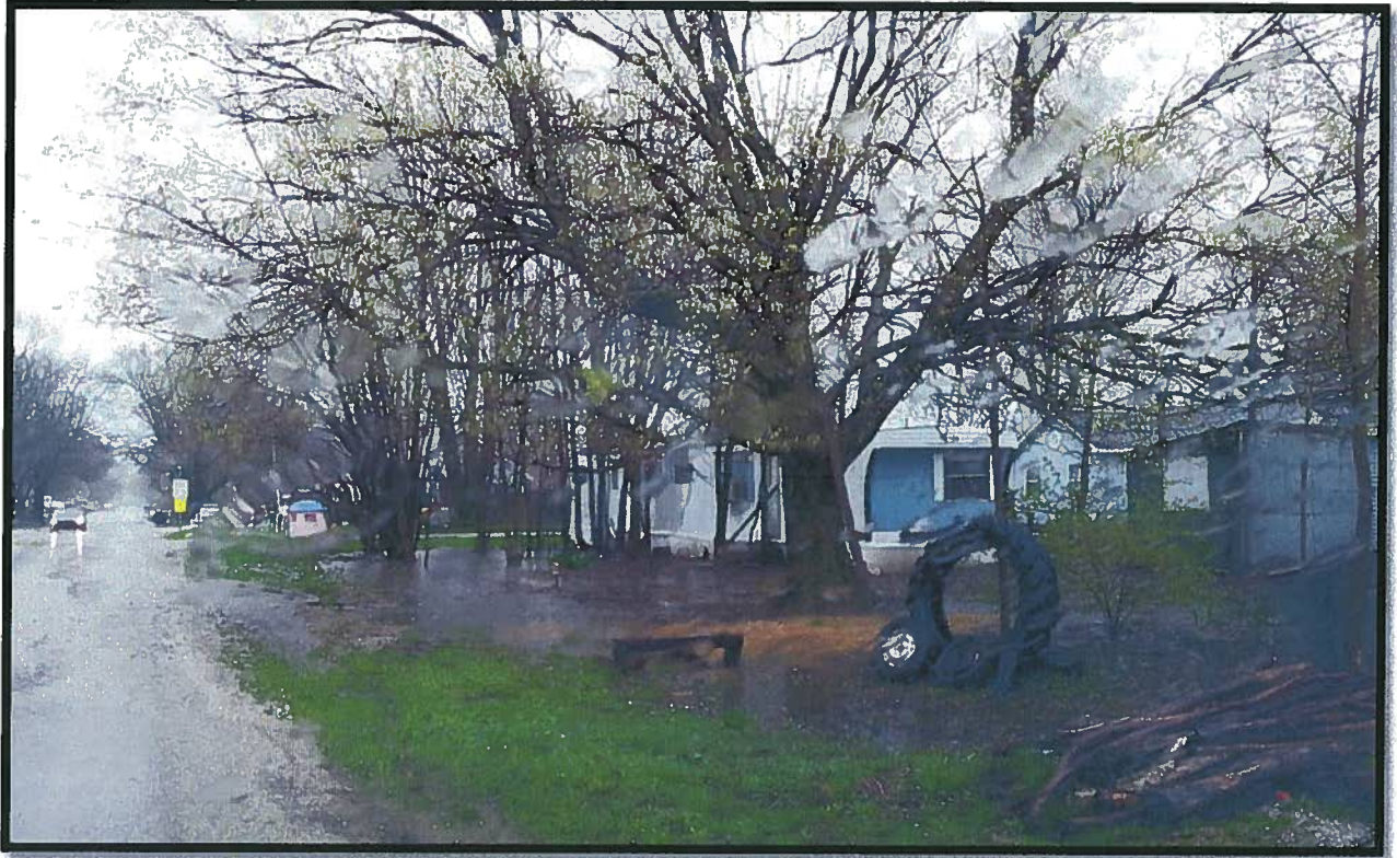
Paul Avenue east of Market Street, facing east

Images taken by RPC staff in 2011 and 2013