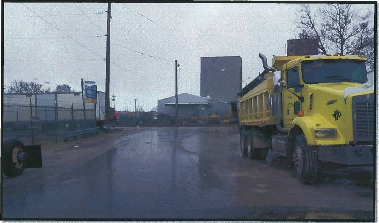
Fifth Street south of Paul Avenue, facing South

Images taken by RPC staff in 2011 and 2013