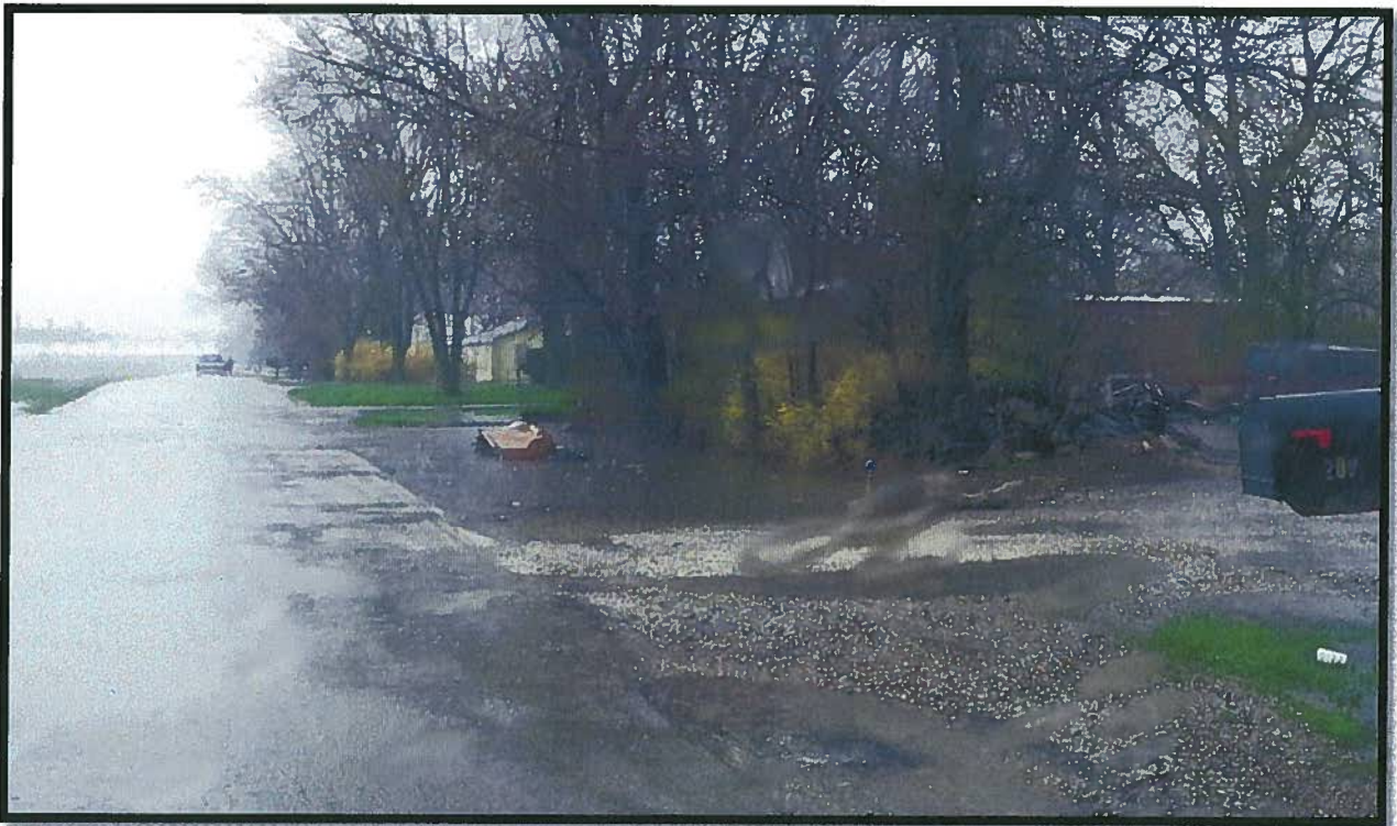
Wallace Avenue west of Third St, south side