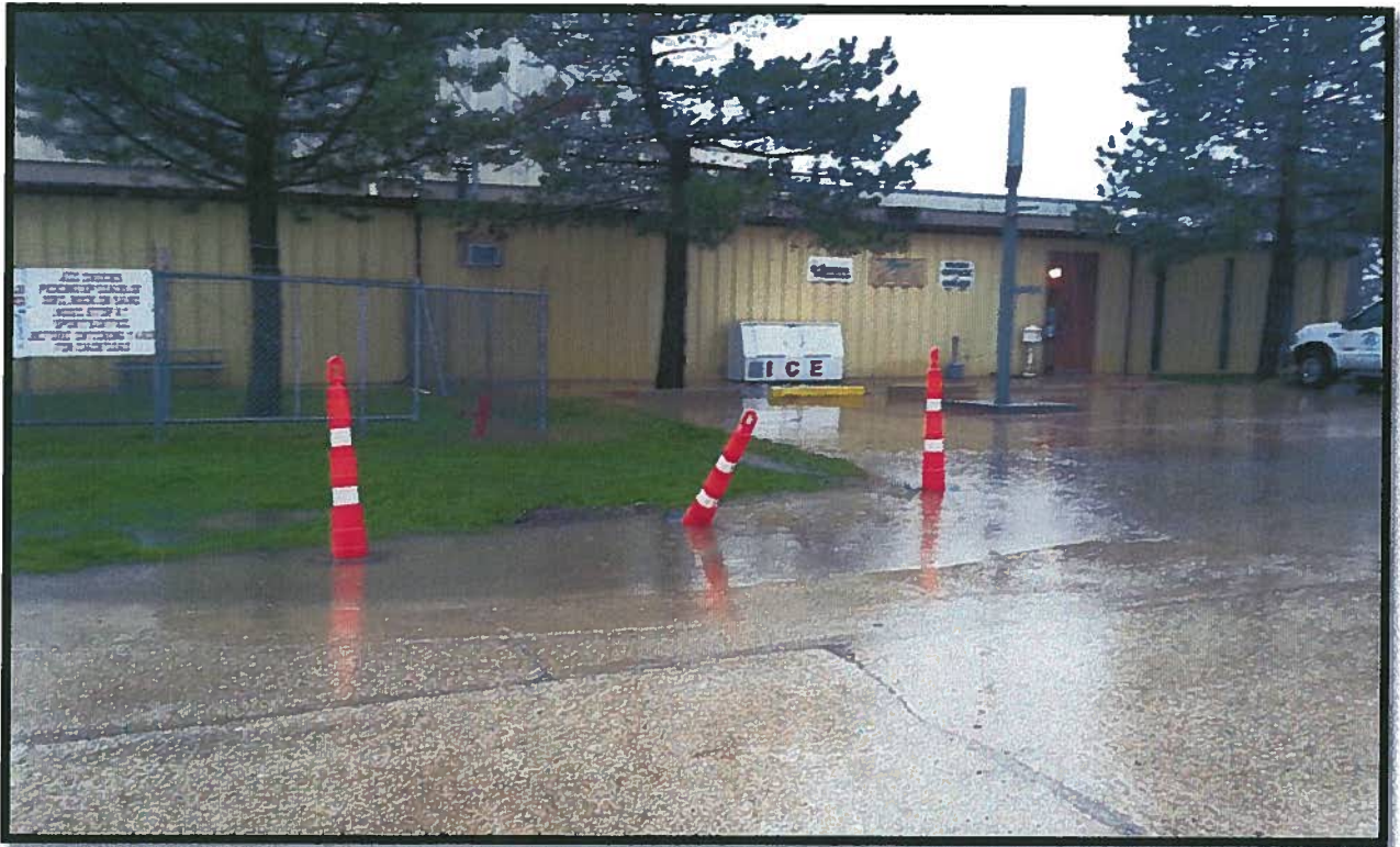
Wilber Avenue west of Fifth Street, south side