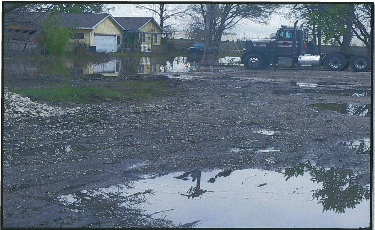
NE corner of Third Street and Paul Avenue, facing north