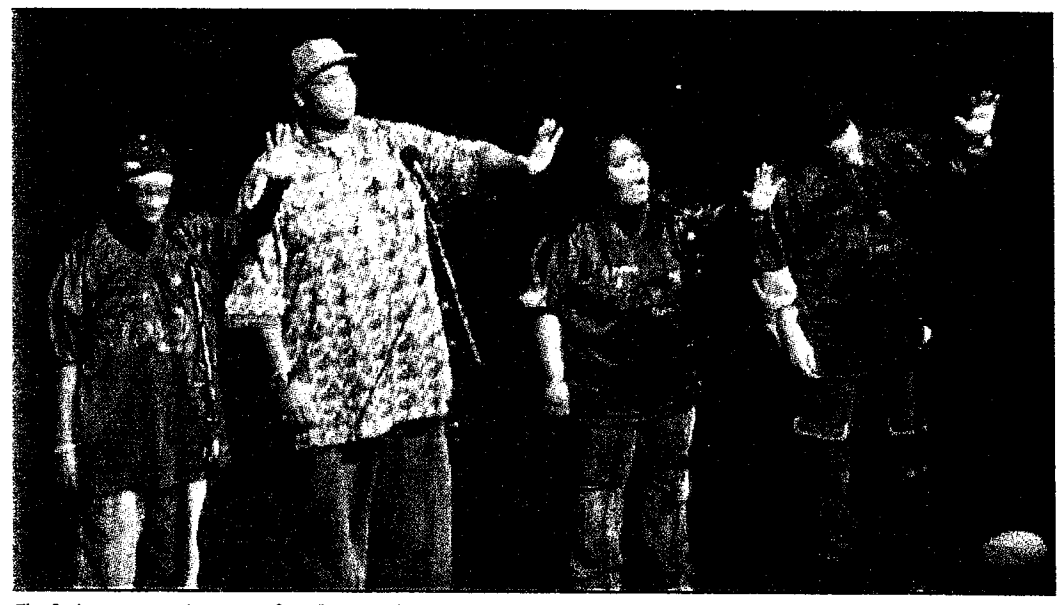
The Steinmetz team in a scene from "Louder Than a Bomb."

I hesitate to hint about the outcome of the contest, nor to