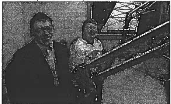
Advocates being interviewed on "Disability Beat"

The Advocates are fully engaged in their community and complete tasks at places such as: schools and universities, government buildings like the courthouse or capital, fairs and resource centers, and local businesses. They make their community a better place by providing quality information on topics that affect those with disabilities the most. An example of this is the "R" Word Campaign. After attending trainings on the topic, Advocates developed informational materials, created and gave presentations to local schools and the University, marched in a parade, educated the community through Radio PSAs, newspapers, and social media, and implemented a petition to end the use of the "R" word.