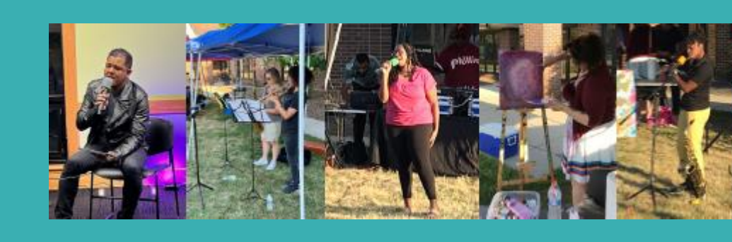
First Year Initiatives